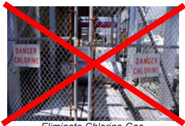
Eliminate Chlorine Gas

Safe and easy to operate, MIOX systems are fully automated, self-diagnosing and neither use nor generate hazardous chemicals.